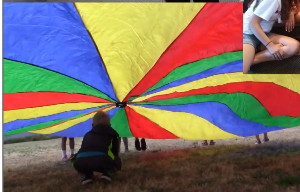
Above: Vacation Bible School